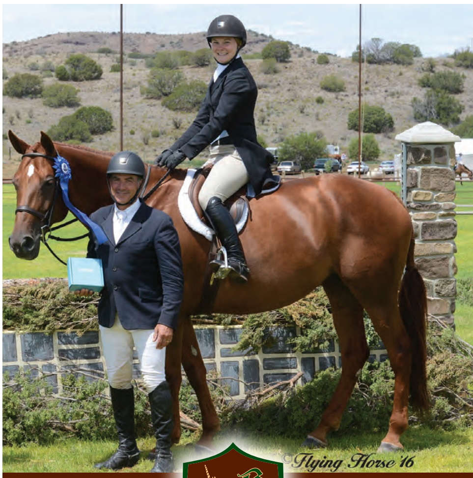
Flying Horse '16